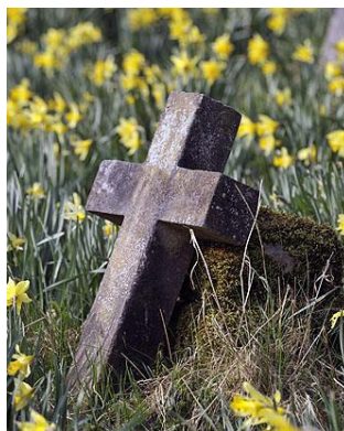
Daffodils growing in an old cemetery, Cumbria, England

Beside the lake, beneath the trees, Fluttering and dancing in the breeze.' Are they considered by any as weeds? I doubt it.