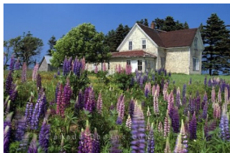
Lupins by an old farm house in Nova Scotia

Do we reap what we sow? When I looked up the definition, I found that a weed in a general sense is a plant that is considered by the user of the term to be a nuisance, and is normally applied to unwanted plants in human-made settings such as gardens, lawns or agricultural areas, but also in parks, woods and other natural areas. More specifically, the term is often used to describe native or nonnative plants that grow and reproduce aggressively. Generally, a weed is a plant in an undesired place.