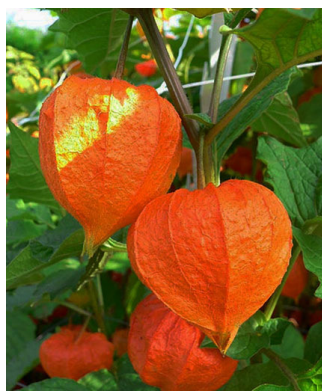
Japanese Lanterns - Physalis

Shortly after arriving back here, I also noted that some neighbours had Japanese lanterns growing in their garden. When I asked, they